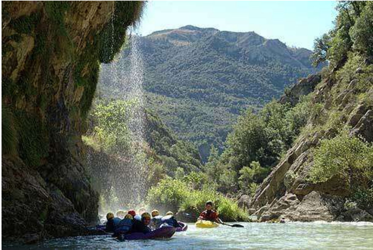
Rafting in Gallego river